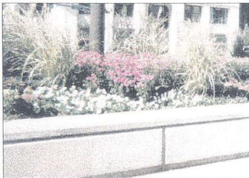
Native and Perennial Plantings